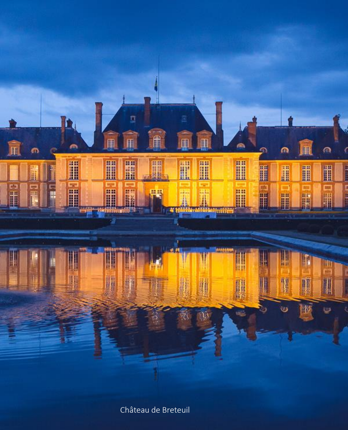
Château de Breteuil