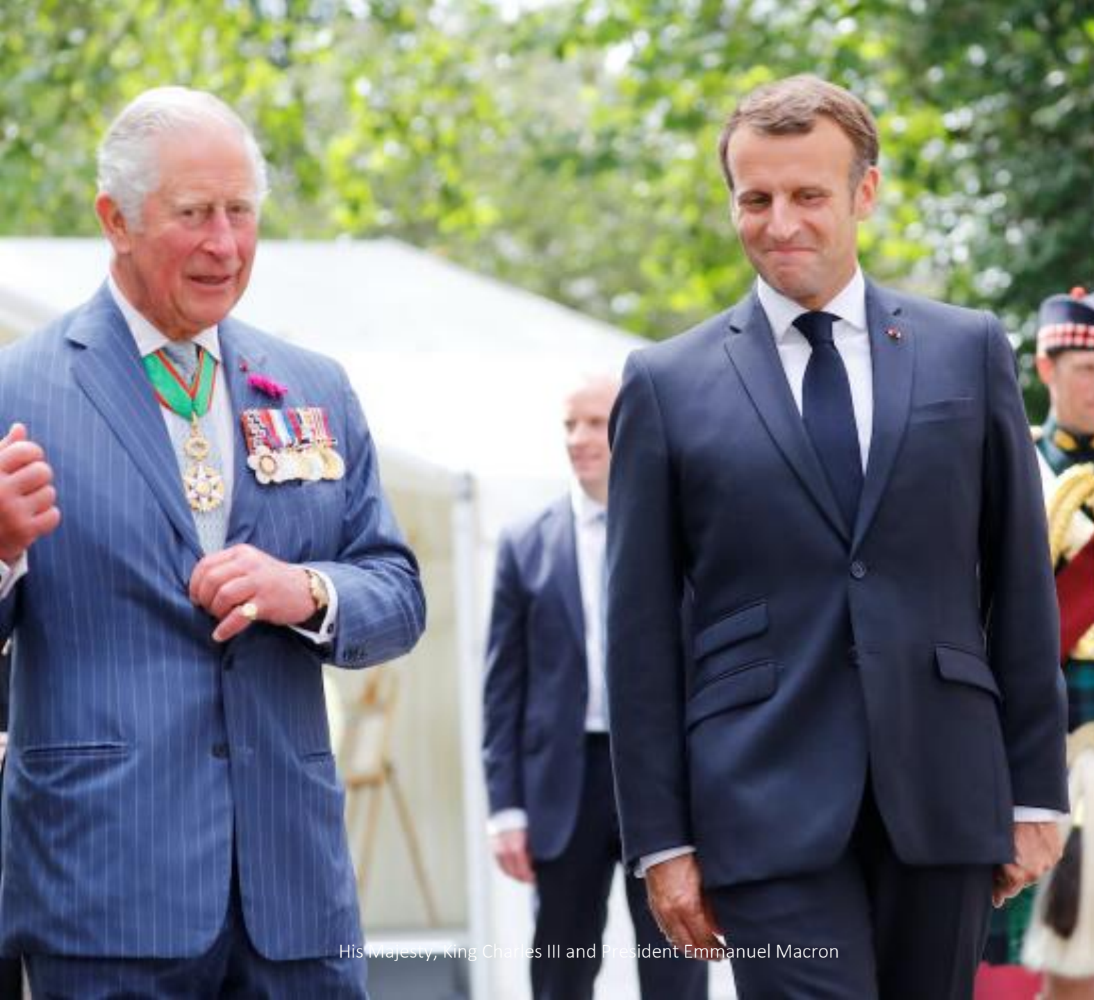
His Majesty, King Charles III and President Emmanuel Macron